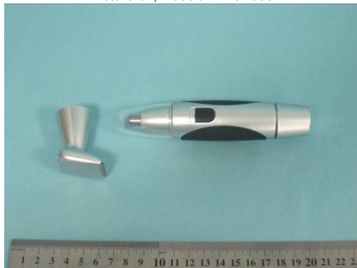
Picture 03, Nose trimmer 888