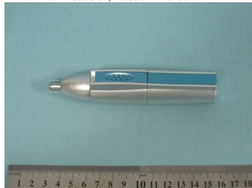
Picture 04, Nose trimmer 300