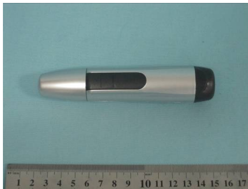
Picture 01, Nose trimmer 588