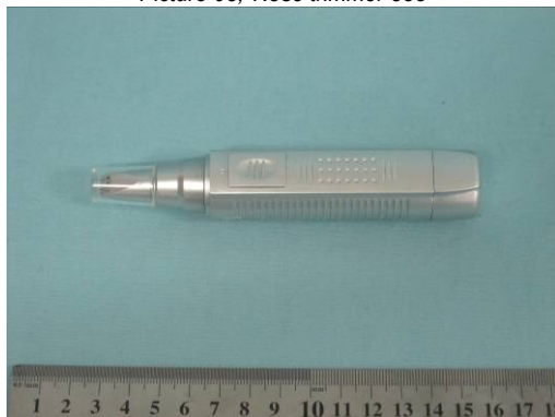
Picture 05, Nose trimmer 308