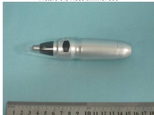
Picture 06, Nose trimmer 206