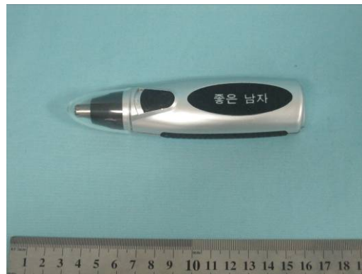
Picture 02, Nose trimmer 001